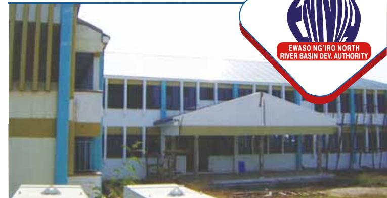
Activities Undertaken By The Authority In Samburu County