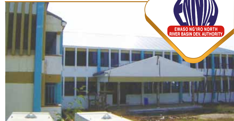
Activities Undertaken By The Authority In Garissa County