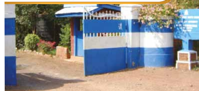
Gum and Resins Plant